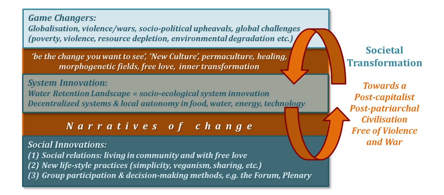
Figure 2: Five Shades of Change and Innovation by/at Tamera

Tamera has synergies with various narratives of change and is connected to several social movements, including not only the global ecovillage movement, but also peace activism, permaculture, gift economy, transition towns, and relocalisation movements more generally. Besides its connection to various narratives and movements, Tamera also has an overt aspiration to create a "New Culture" and a "New Image". The notion of "Terra Nova" (Portuguese for 'New World') is described as "the vision of a new Earth. It contains the image of a post-patriarchal civilization free of violence and war" (Tamera website).